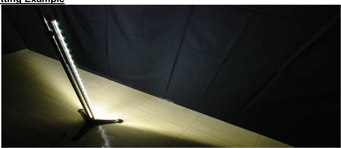
Light-emitting Angle of 140°